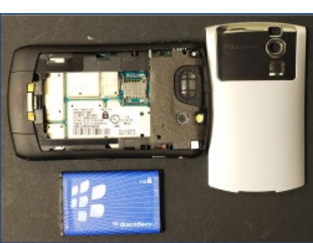
Figure 1 – Battery Removal