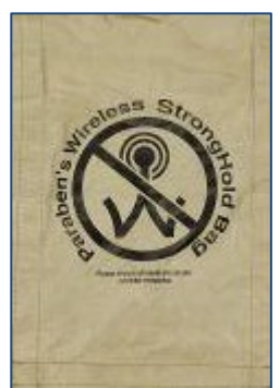
Figure 4 – Faraday Bag